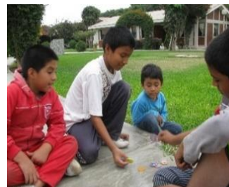
Time to have fun!