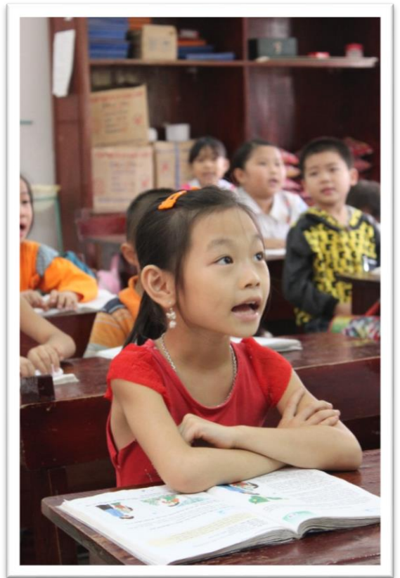
Children in the SOS School in Viet Tri

National, provincial and municipal contests are regularly attended by students with approximately 100 students gaining awards in disciplines like scientific research, interdisciplinary knowledge, sports and practical skills. Similarly, teachers participate in teaching contests with 3 teachers obtaining